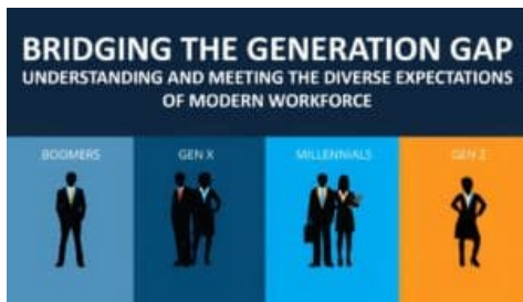
Generational differences in the workplace